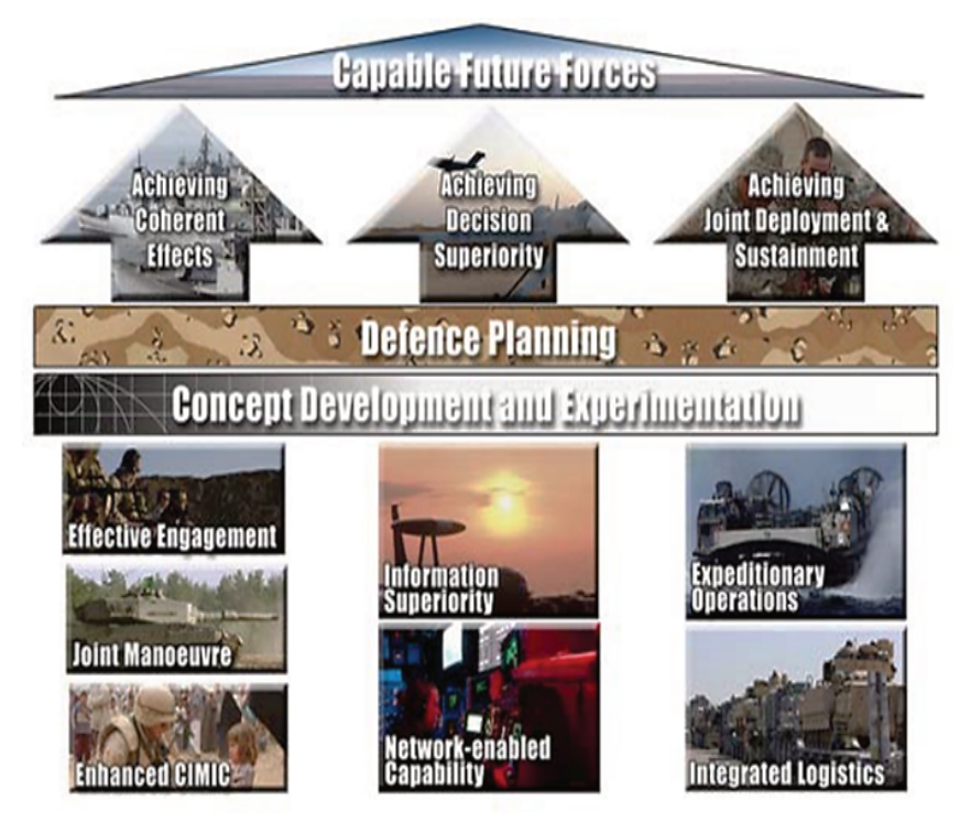
Fig. 1 Concept and goals of the Network Enabled Capability [2]

"The Network Enabled Capability (NEC) is a new art of military operations and combat in the information age. It is the response to current and future challenges of the information age in the military field. From a broader perspective, NEC describes a combination of strategies, modern tactics, methods, and procedures that can be applied in networked military forces to achieve superiority over the enemy. In links sensors, command points, and combat systems operate in a collaborative environment. The NEC must ensure the exchange of information, utilizing communication networks which are interoperable and robust. These networks should also support the collection, fusion, analysis and distribution of information." [2] (Fig. 1).